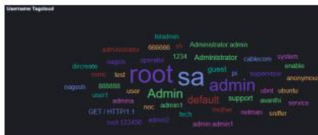
(A) Cloud of Username Tags