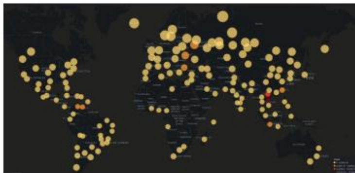
Figure 2: Honeypot Attack Map on AWS.

This is true because the origin of the attack may not be accurately represented by the data given the availability of technologies like VPNs or the possibility that threat actors may use other affected systems as stepping stones. The findings from the Cowrie honeypot point to the usage of automation by attackers as well as predefined credentials and passwords taken from a dictionary to go around authentication ( Figure 3 ). Additionally, an examination of the attacker input commands recorded by this honeypot revealed attempts to increase their privileges and conduct (system) information gathering before attempting to accomplish their goals