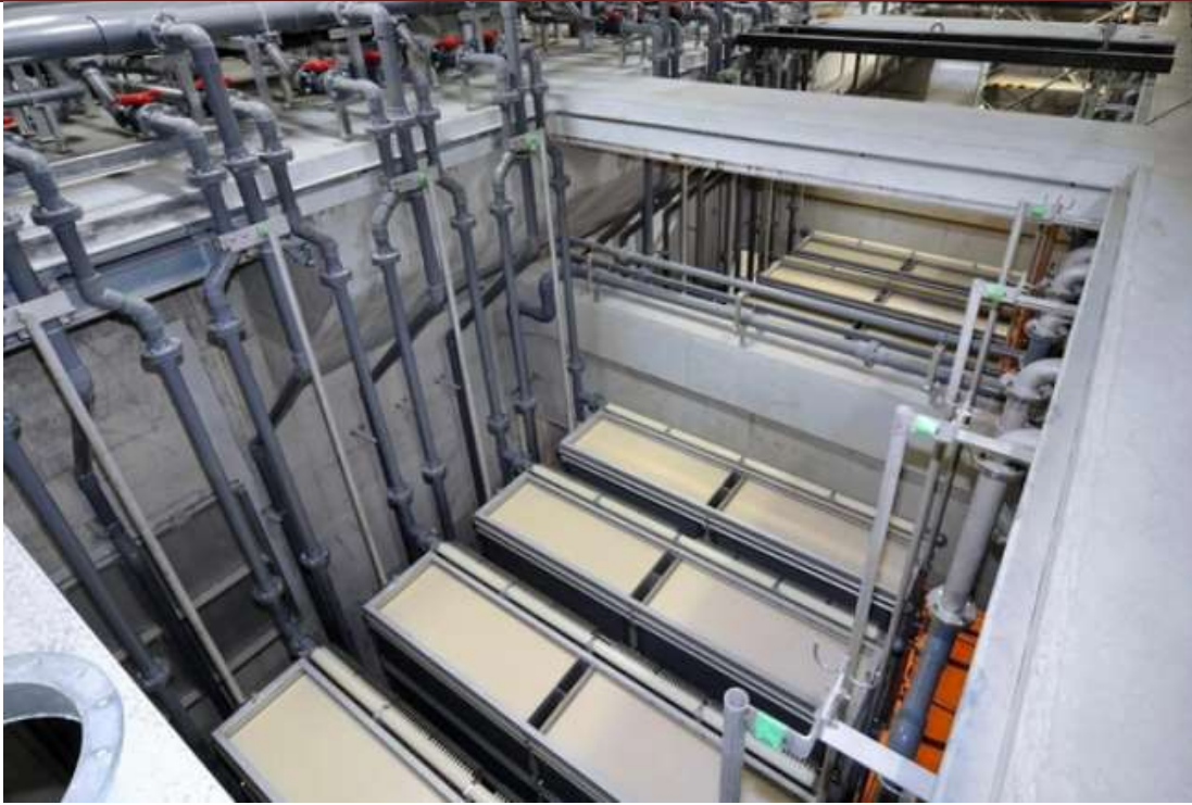
Fig. 3. MBR filter is used to treat high-concentration industrial wastewater in Bac Ninh Industrial Park