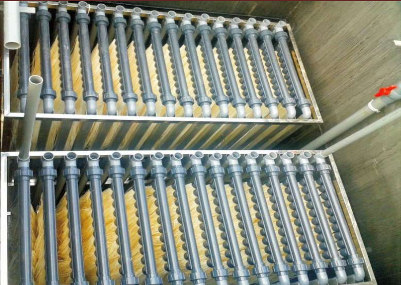
Fig. 5. MBR filter is used to treat high-concentration industrial wastewater in Bac Ninh Industrial Park