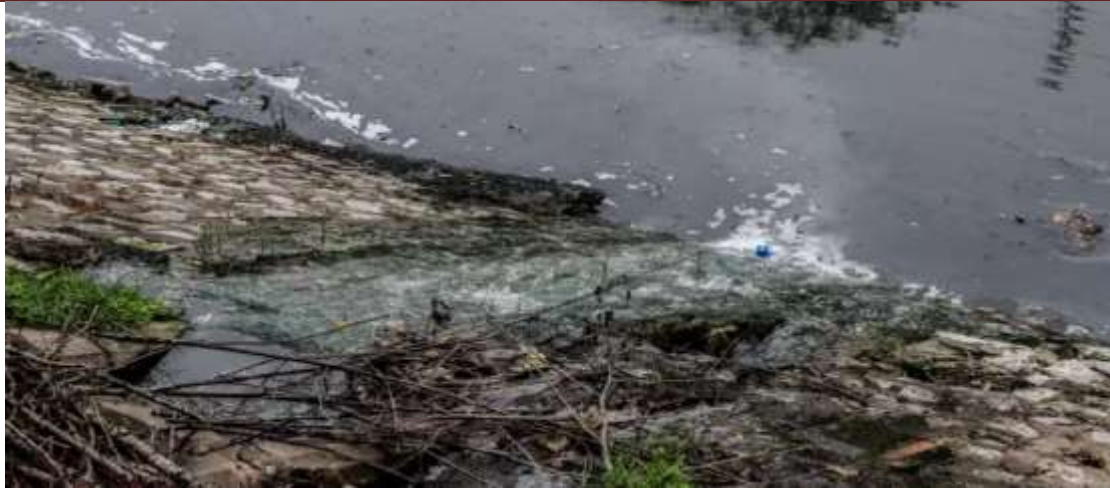
Fig. 2. Water pollution in the vicinity of Vsip_Bac Ninh industrial park

Wastewater treatment is an urgent issue in the industry. The ever-increasing production and consumption of goods has posed many challenges in the management and treatment of wastewater in factories, workshops, industrial parks and other production facilities. Wastewater generated from industrial activities contains a variety of toxic chemicals, bacteria, and other contaminants, which can be dangerous to human health and the environment if not treated properly.