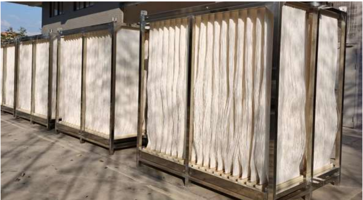
Fig. 4. MBR filter is used to treat high-concentration industrial wastewater in Bac Ninh Industrial Park